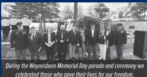
During the Waynesboro Memorial Day parade and ceremony we celebrated those who gave their lives for our freedom.