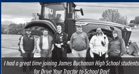
I had a great time joining James Buchanan High School students for Drive Your Tractor to School Day!

Penn State Mont Alto has long been a cherished educational institution in our community. I was deeply saddened by and fought against Penn State's plans to close the branch campus. Since the announcement, I have been working to find a path toward it staying open, or it remaining an educational option in some way.